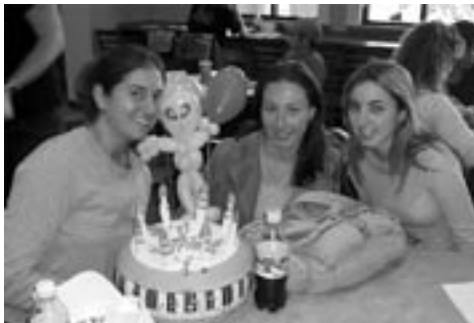
As midterms approached, the Rosen College and Hospitality Management students had a stress-free day. The event included balloon creations, body art and personalized dog tags.