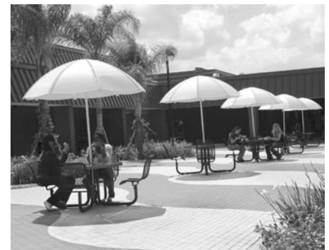
CSEL's office space will expand to Ferrell Commons 208.