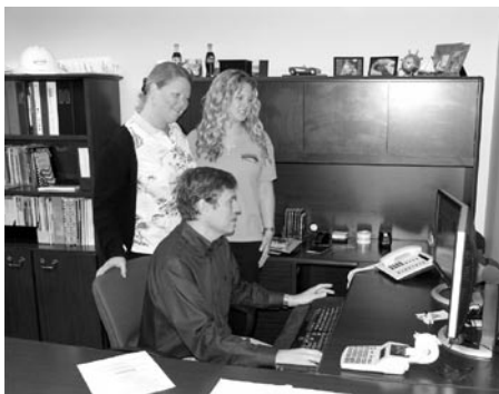
Alcohol and Other Drug Prevention Programming staff