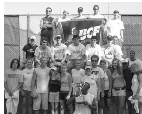
The UCF Tennis Club won first place at the Gaterbowl in Gainesville, October 2005.

In an effort to include players of all levels, the Tennis Club hosted the Tennis Fair for the second straight year on March 8. Students were encouraged to come out to play, meet new friends, and enjoy a fun cardio workout.