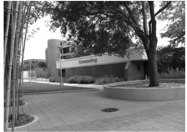
The new Counseling Center is located next to the Health Center.

CSEL is a collaboration between Student Development and Enrollment Services and Undergraduate Studies, which creates